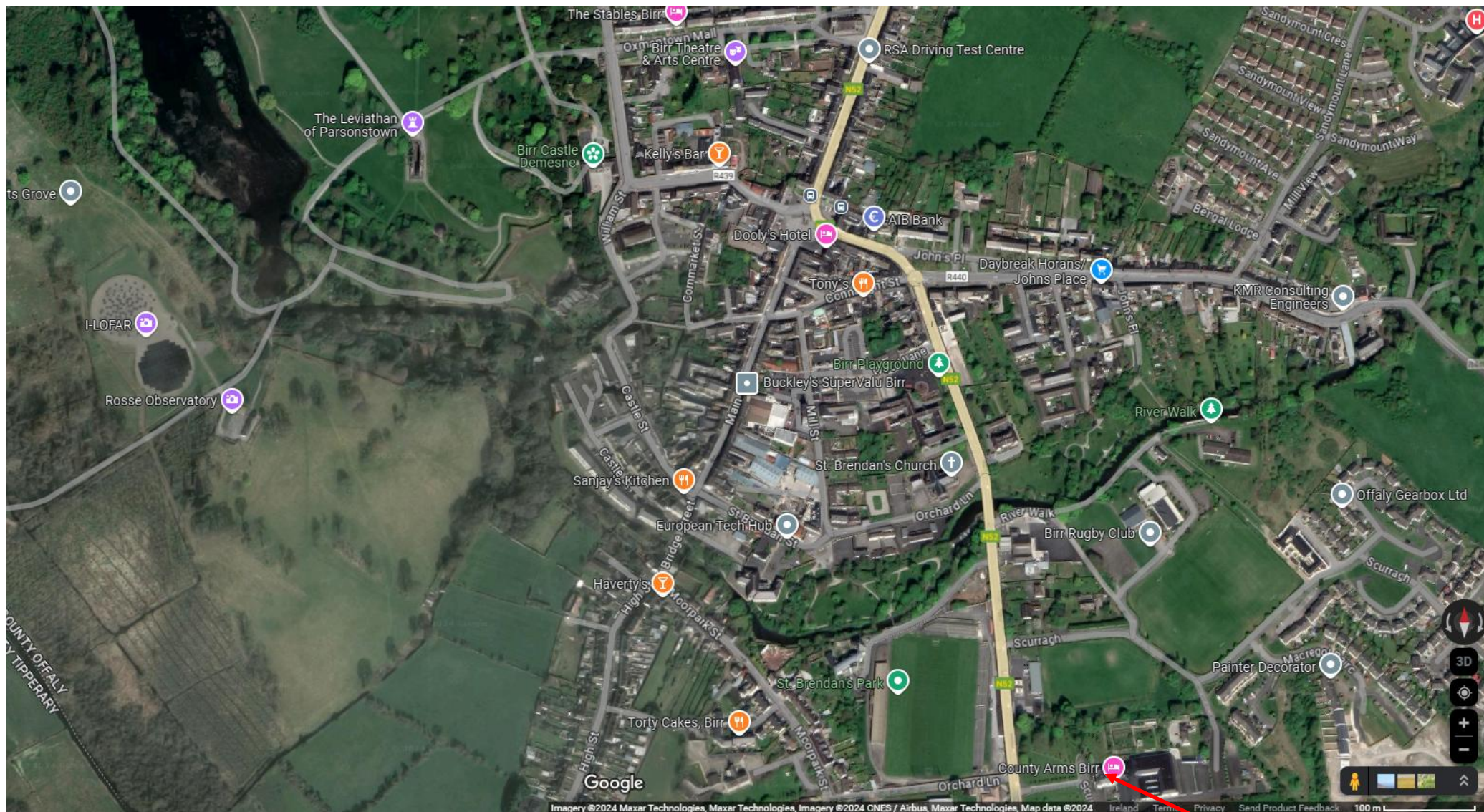
County Arms Hotel